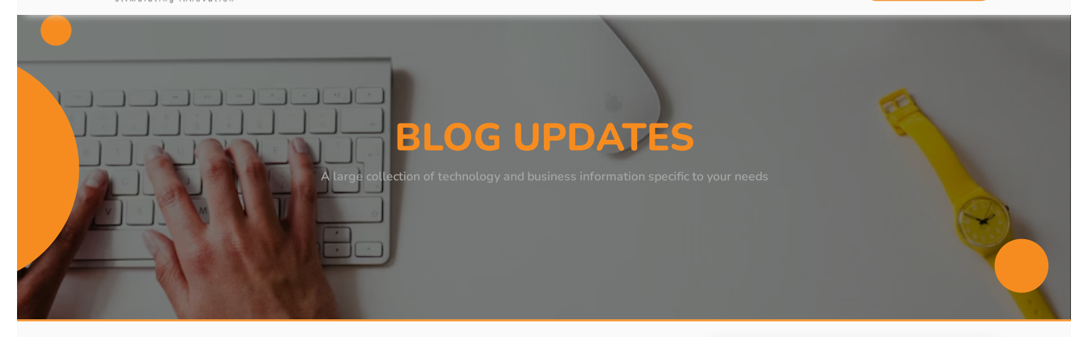
Home » Mobile App Development » 10 Best Taxi Booking Apps in USA 2023